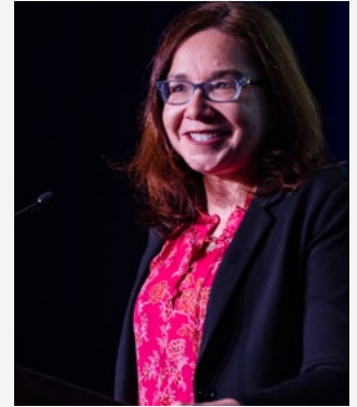
Dr. Katharine Hayhoe

In November, our “Grit and Gratitude” virtual conference brought together over 2,390 participants and kicked off a week of action across the United States. Attendees enjoyed remarks by prominent voices in the national climate space and attended their choice of breakout sessions, including an update from the United Nations’ climate conference, COP26.